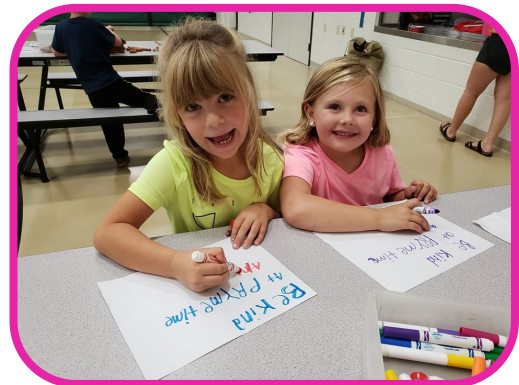
YMCA Pryme Time Afterschool Care