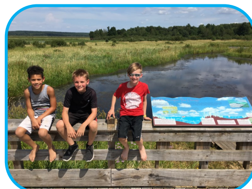
YMCA Summer Day Camp Field Trip